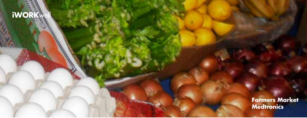
Farmers Market Medtronics