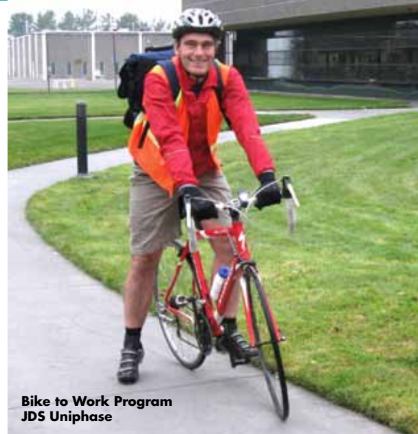
Bike to Work Program JDS Uniphase