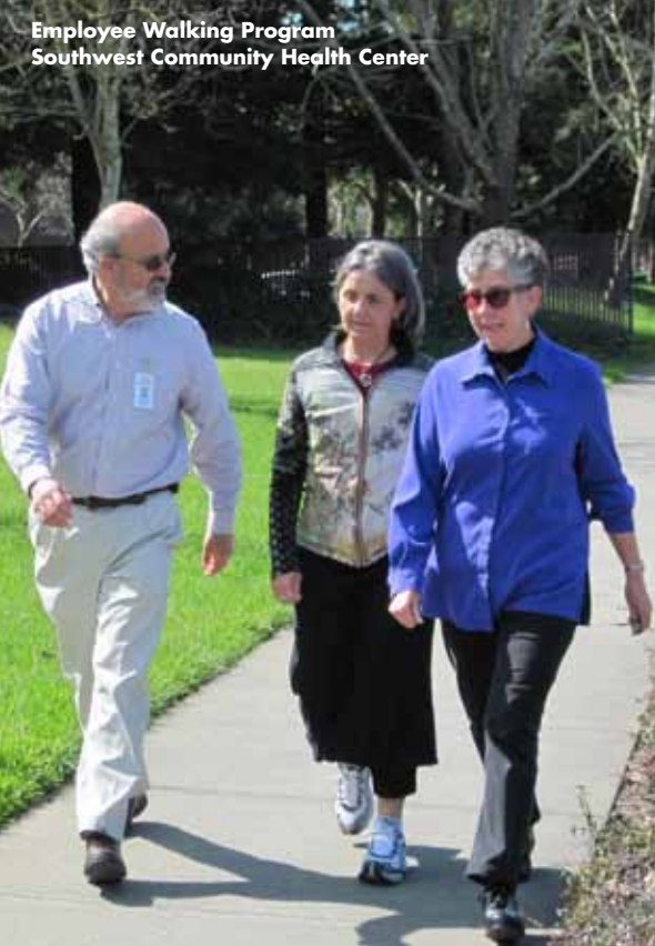
Employee Walking Program Southwest Community Health Center

Employers are awarded Bronze, Silver or Gold classification based on the breadth and depth of their employee wellness initiatives. Visit www.sonomaEDB.org/wellness to complete a simple online application.